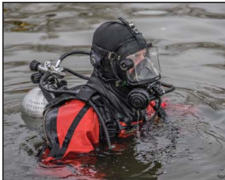
Above, on April 7 a truck rolled into Cherry Creek Reservoir. Our Dive Rescue Team attached a tow cable to the truck so it could be pulled out. At right, flames churn along the Cherry Creek Trail in Parker on April 13. The wildfire was the second in two days along the popular trail.