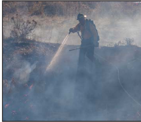
Above, a firefighter douses a wildfire along the Cherry Creek Trail the evening of April 12.