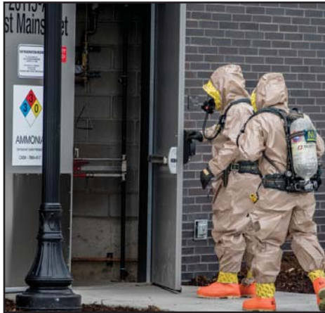
Above, firefighters in hazardous materials suits enter a mechanical room to investigate a possible ammonia leak on May 2. Below, agency representatives plan how to extinguish the Cherry Creek Trail fire safely.